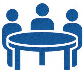
TABLE OF UNITY

Purposeful Projects Through Partnerships