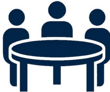
TABLE OF UNITY

TABLE OF UNITY is more than a charity — it's a movement of faith-driven hearts committed to practical, lasting change. Rooted in compassion, strengthened by unity , and sustained through service and enterprise, we are here to bring hope and restoration to every home and every heart we can reach.